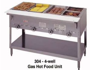
304 - 4-well Gas Hot Food Unit

Aerohot Steamtable Hot Food Unit, 72-3/8"L, gas, (5) 12"x20" hot food wells with adjustable gas valve controls with adjustable pilot light, s/s top w/1/2" thick x 7" wide poly carving board, s/s open base w/undershelf, legs & feet