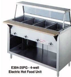
E304-25PG - 4-well Electric Hot Food Unit

AeroServ Hot Food Unit, gas, 74"L, 24.5"W, 36"H, 20gauge s/s top, 5 galvanized steel dry heat wells, 5 standing pilots, individual valve controls, a gas regulator, 20gauge paint grip steel body & undershelf, 6"H s/s legs & adjustable feet