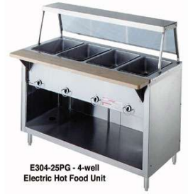
E304-25PG - 4-well Electric Hot Food Unit

AeroServ Hot Food Unit, gas, 74"L, 24.5"W, 36"H, 20gauge s/s top, 5 galvanized steel dry heat wells, 5 standing pilots, individual valve controls, a gas regulator, 20gauge paint grip steel body & undershelf, 6"H s/s legs & adjustable feet