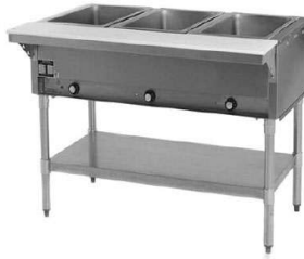
#DHT3-120 hot food table

Hot Food Table, electric, 63-1/2" L, (4) 12"x20" (dry) wells w/infinite controls, stainless steel top w/8" poly cutting board, galv undershelf & tubular legs, adjustable feet, 120v/60/1-ph, 2000w, 16.7 amps, NEMA 5-30P, NSF, UL listed