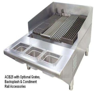
ACB25 with Optional Grates, Backsplash &amp; Condiment Rail Accessories

Achiever Charbroiler, 72,000 BTU, 25-3/8"W, countertop, (4) cast iron 18,000 BTU burners with standing pilots and cast iron radiants, manual gas valve controls, stainless steel front, sides, top trim, backsplash & grease trough, cast iron top grates, 4" adjustable legs, CSA, NSF