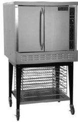
Model 100-CO-1SD (Shown with optional casters & bottom shelf with storage racks)

100 Series Convection Oven, Gas, single deck, 43" bakery depth, 2-speed, solid state manual controls, 60 min. timer, solid s/s doors, porcelainized interior, s/s front, door gaskets & handle, aluminized steel sides, black 100 Series Legs, 12 rack positions w/3 racks, 1/2 HP motor, 80,000 BTU