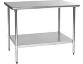
Units 96" to 120" in length come with six legs Units 132" to 144" in length come with eight legs

Spec-Master® Work Table, 48"W x 72"L, 14 gauge type 304 stainless steel top with rolled edges front & back, square turndown ends, 18 gauge galvanized adjustable undershelf, 1-5/8" O.D. 16 gauge galvanized legs, adjustable high impact plastic bullet feet, Uni-Lok® system