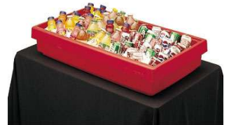
Table Top Food Bar, 67-1/2" x 24" x 7", 5-pan capacity, black, NSF

Carlisle 6600-01 Sell: $563.89 ea Cold Food Pan, Table Top