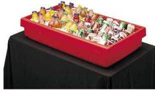
Table Top Food Bar, 67-1/2" x 24" x 7", 5-pan capacity, black, NSF

Cambro 5FBRTT-110 Sell: $633.94 ea Cold Food Pan, Table Top