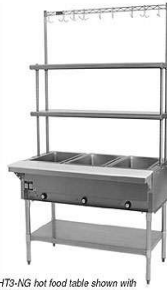
#HT3-NG hot food table shown with optional Flex-Master® overshelves

Hot Food Table, LP Gas, 63-1/2" L, (4) 12" x 20" (dry) wells with burner controls in recessed panel, s/s top with 8" poly cutting board, galvanized undershelf & tubular legs, adjustable feet, 14,000 BTU