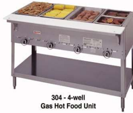
304 - 4-well Gas Hot Food Unit

Aerohot Steamtable Hot Food Unit, 72-3/8"L, gas, (5) 12"x20" hot food wells with adjustable gas valve controls with adjustable pilot light, s/s top w/1/2" thick x 7" wide poly carving board, s/s open base w/undershelf, legs & feet