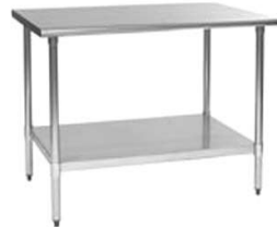
Units 96" to 120" in length come with six legs Units 132" to 144" in length come with eight legs

Spec-Master® Work Table, 48"W x 72"L, 14 gauge type 304 stainless steel top with rolled edges front & back, square turndown ends, 18 gauge galvanized adjustable undershelf, 1-5/8" O.D. 16 gauge galvanized legs, adjustable high impact plastic bullet feet, Uni-Lok® system