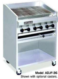
Model ADJF-36 Shown with optional casters.

Charbroiler, Gas, Floor Model, 24" wide, radiant type, 3-position adjustable cast iron grates w/easy lift handle, burners every 6", s/s liner, grease pan, open cabinet base, s/s front & sides, 6" legs, AGA, CGA, NSF, 80,000 BTU