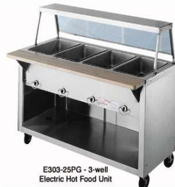
E303-25PG - 3-well Electric Hot Food Unit

AeroServ Hot Food Unit, electric, 74"L, 24.5"W, 36"H, 20ga s/s top, 5 s/s sealed heat wells, drains, copper manifolds, one brass valve, infinite controls, 20ga paint grip steel body & undershelf, 6"H s/s legs & adjustablefeet