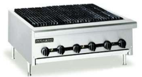
Model AERB-36 Shown with optional 4" legs

Charbroiler, Gas, Counter Model, 24" wide, radiant type, reversible cast iron grates, burners every 6", removable full width grease pan, s/s front & sides, AGA, CGA, NSF, 60,000 BTU