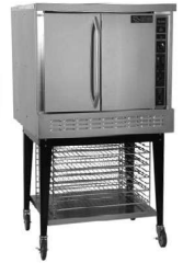
Model 100-CO-1SD (Shown with optional casters & bottom shelf with storage racks)

100 Series Convection Oven, Gas, single deck, 43" bakery depth, 2-speed, solid state manual controls, 60 min. timer, solid s/s doors, porcelainized interior, s/s front, door gaskets & handle, aluminized steel sides, black 100 Series Legs, 12 rack positions w/3 racks, 1/2 HP motor, 80,000 BTU