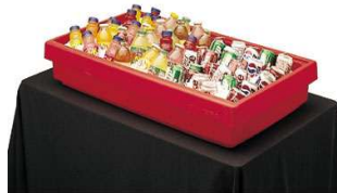
Table Top Food Bar, 67-1/2" x 24" x 7", 5-pan capacity, black, NSF

Cambro BUF72-110 Sell: $225.11 ea Cold Food Pan, Table Top